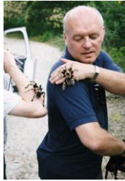
Tarantula from Costa Rica